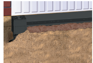
Lay channels from outlet corner unit ensuring joints clip together. Fit endcaps. With Brickslot covers fitted haunch around channels with concrete. Bricks/paviours should be laid in mortar for lateral stability. Final surface to be 3-5mm above slot.