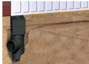
Knock out preformed base of corner unit and remove appropriate cut-out for channel connection. Connect corner unit to sump. Check line and level of corner unit and backfill with concrete.