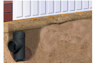
If using sump unit as outlet cut off outlet spigot, position sump in concrete bed and fit PVC-U Ø110mm pipework connection to drainage. Corner and sump unit must be fitted in order to allow subsequent access for maintenance and cleaning.