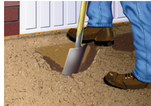
Dig trench 325mm wide (225mm wide if against a structure) by 208mm deep for channel (408mm deep for sump). Mark finishing height with fixed line 3mm below final surface. Lay 50mm (min.) bed of concrete.